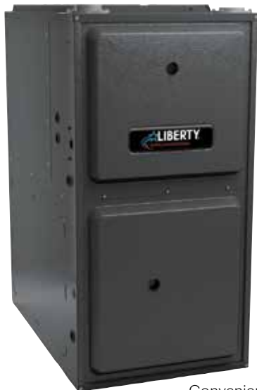
Convenient 33 \frac{3}{8} " height unit

Two-Stage Gas Valve – Reduces energy needed during moderate demand to deliver outstanding comfort and efficiency as compared to single-stage gas valves.